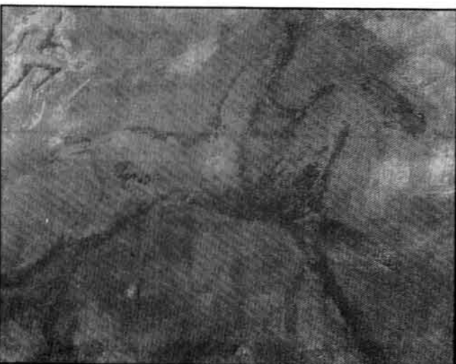
Fragment of The Race, acrylics and pigments on wood and canvas.

Olive trees, mills, old estates, old people, coves... all these common areas with which the artists transmit the Majorcan style, are treated in the refreshing way which each one of these themes calls for. (Horrach Moya)